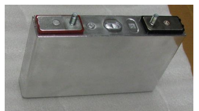
Figure 2. Individual 90 Wh cell removed from the battery module.

In addition, packages containing about 519 liters (137 gallons) of Class 3 flammable materials and other hazardous materials were commingled with the lithium-ion batteries on a single pallet. An adjacent pallet contained an additional 439 liters (116 gallons) of Class 3 flammable materials; no other hazardous materials were identified elsewhere on the main cargo deck. Thus, all of the declared hazardous materials were concentrated in a single location on the airplane.