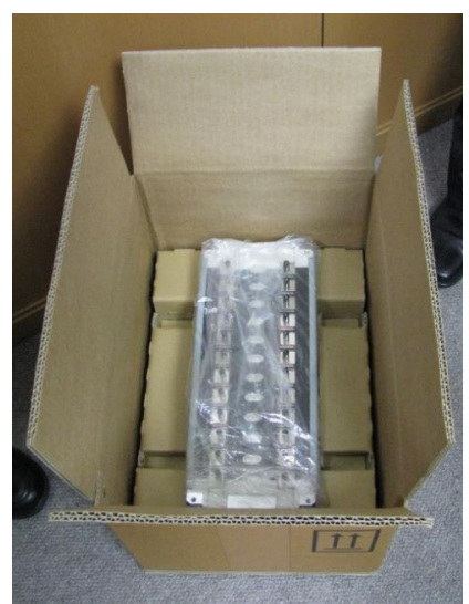
Figure 1. A 12-cell lithium-ion battery contained in a Packing Group II fiberboard box.